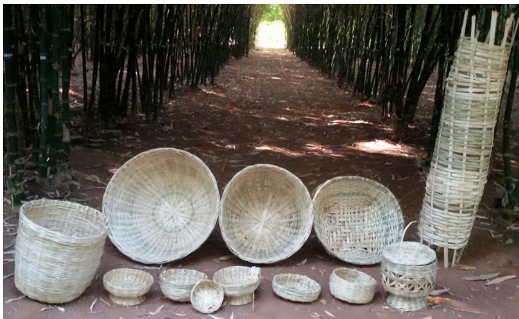
Figure 3. Bamboo based handicraft products

Dry poles and strips of bamboo culms are used in construction industries and handicraft industries respectively (Figure 3). While considering 114 USD/tonne of market price, total revenue of 7696.14 million USD can be generated through construction industry from bamboo produced on marginal land of India. Similarly, total revenue of 9788.95 million USD per year can be generated through handicraft industry considering market price of 145 USD/tonne. Moreover, direct employment (around 2.5 persons/ha) of 5.77 million people can also be generated from bamboo cultivation on marginal land. Bamboo would support Make in India and Skill India initiative of Government of India through employment to the local youth in handicraft industries. It would provide employment to women of the rural regions as handicraft industry fosters women to learn and apply their skills. Employment to women in handicraft industries would empower them and provide financial independence and upliftment of women and strengthen their role in decision making in households.