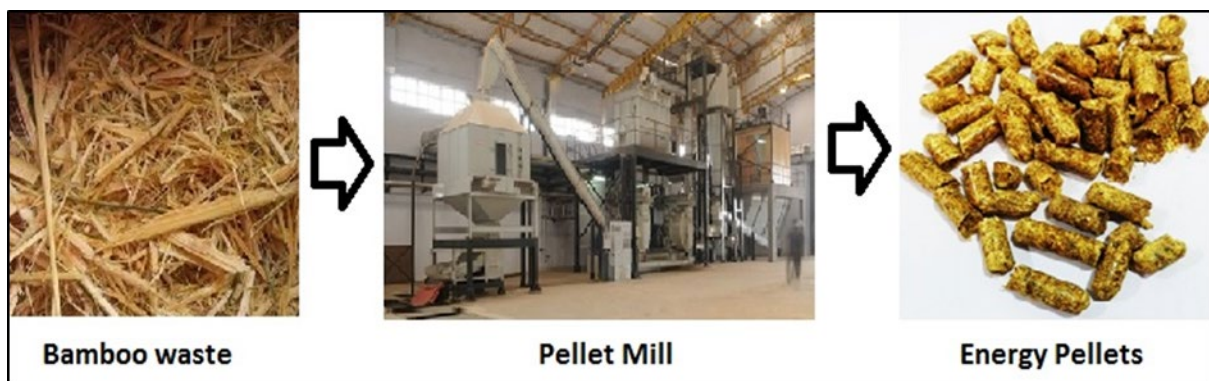
Figure 5. Energy pellets production from bamboo

Waste biomass generated from incense sticks can be used in energy pellets production (Figure 5). While considering 80% waste from total bamboo biomass in incense sticks production process, total 54.00 mMT energy pellets can be produced per annum from bamboo cultivated on marginal land. Thus, energy pellets produced from incense sticks waste itself can generate revenue of 13,987 million USD per annum with energy pellet market rate of 259.02 USD/tonne.