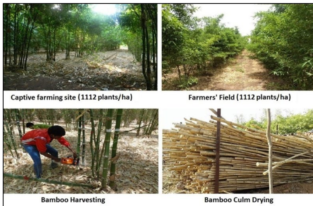
Figure 2. B. balcooa cultivation, harvesting and drying

Figure 2 shows bamboo cultivation at captive farming sites, at farmers' field, harvesting of bamboo and sun drying of harvested bamboo culms.